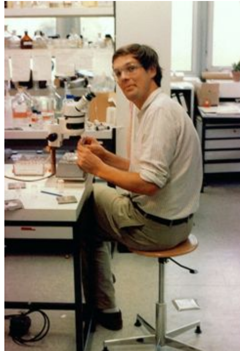
Sakmann in Göttingen, 1980. He and Neher did the work themselves.