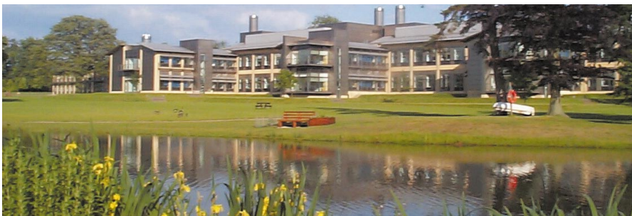
Success: the Sanger Centre is a major player in the Human Genome Project, thanks to the trust's millions.

In unguarded moments, some British biomedical scientists complain that the trust's governors have too much power, and voice