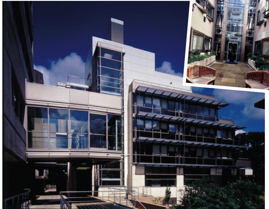
Management problems at Wellcome's Oxford epidemiology centre damaged the trust's public image.