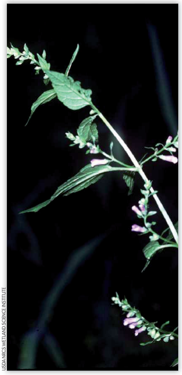
Plant life: Scutellaria lateriflora L.

digestive tract (Khosh, 2000) and Native American women traditionally used it for premenstrual tension (Indiana Medical History Museum, undated). The herb is also used extensively and highly valued in traditional western herbal medicine. It was mentioned in the first American materia medica in 1785 but had been in longstanding use as a home remedy before then (Lloyd 1911; 109).