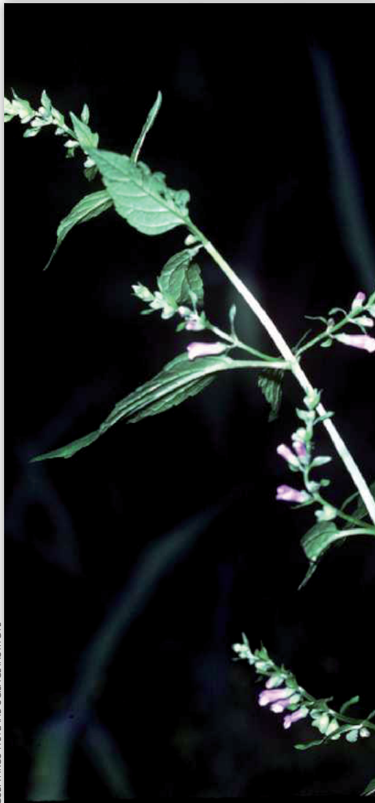
USDA NRCS WETLAND SCIENCE INSTITUTE