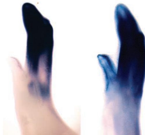
Telltale tracers. The initial digits in developing wings arise where Hoxd13 is expressed (right, dark stain) and Hoxd12 isn't (left, dark stain).